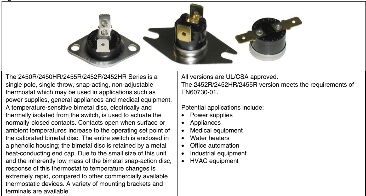
Figure 2. 2450R/2450HR/2455R/2452R/2452HR Series Phenolic Automatic Reset Thermostat

The 2450R/2450HR/2455R/2452R/2452HR Series is a single pole, single throw, snap-acting, non-adjustable thermostat which may be used in applications such as power supplies, general appliances and medical equipment. A temperature-sensitive bimetal disc, electrically and thermally isolated from the switch, is used to actuate the normally-closed contacts. Contacts open when surface or ambient temperatures increase to the operating set point of the calibrated bimetal disc. The entire switch is enclosed in a phenolic housing; the bimetal disc is retained by a metal heat-conducting end cap. Due to the small size of this unit and the inherently low mass of the bimetal snap-action disc, response of this thermostat to temperature changes is extremely rapid, compared to other commercially available thermostatic devices. A variety of mounting brackets and terminals are available.